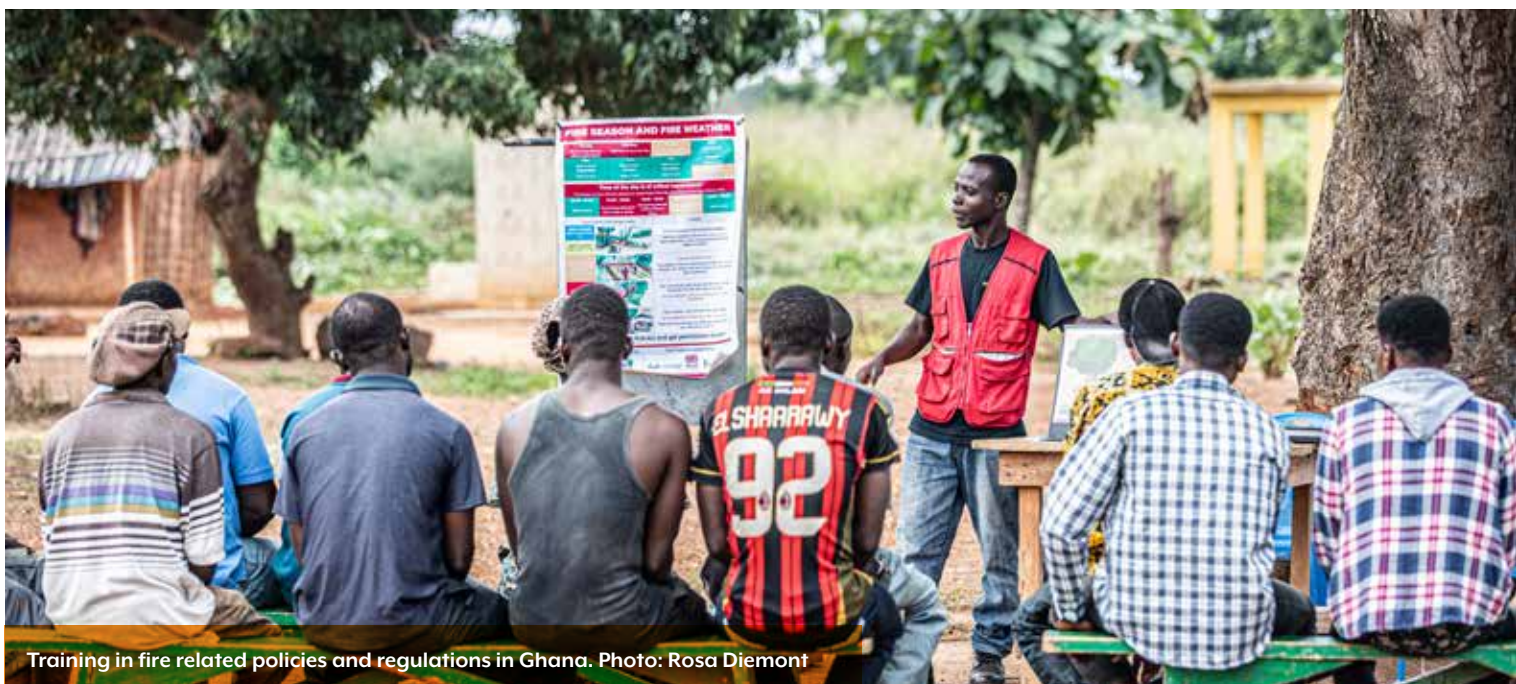
Training in fire related policies and regulations in Ghana.

In Indonesia, integrated landscape approaches — supported by policies and with the full participation of communities — are proving effective in reducing wildfire risks while also restoring peatland areas [3.1]. The articles