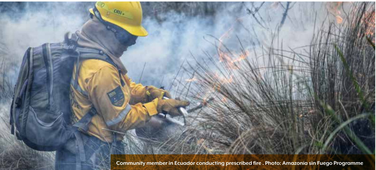
Community member in Ecuador conducting prescribed fire .

During this time, the extent and severity of wildfires in some countries coincided with a number of significant changes in land ownership and use, and migration. These changes included both the settling of “new land,” especially in the tropics, and the abandonment of rural areas, which was common in the Mediterranean, for example. A major factor was the use of enclosure measures that gave ownership of large tracts of previously communal land to individuals (or companies), and that limited or even prohibited access by local people. This was a common occurrence during the colonial period, alongside the discouraging or banning of traditional burning practices. There was also extensive clearing of forests for the expansion of agricultural and pastoral land, and for new settlements.