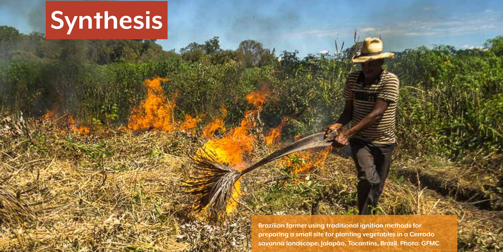
Brazilian farmer using traditional ignition methods for preparing a small site for planting vegetables in a Cerrado savanna landscape, Jalapão, Tocantins, Brazil.